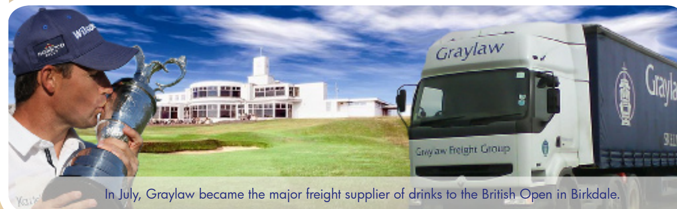
In July, Graylaw became the major freight supplier of drinks to the British Open in Birkdale.

Eden Park entrusted Graylaw to Handle with Care the safe transit to the IoM of some of the world's most valuable plants.